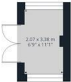
Floor 0 Building 3

Approximate total area (1) 138.6 m 2 1493 ft 2 Reduced headroom 5.2 m 2 56 ft 2