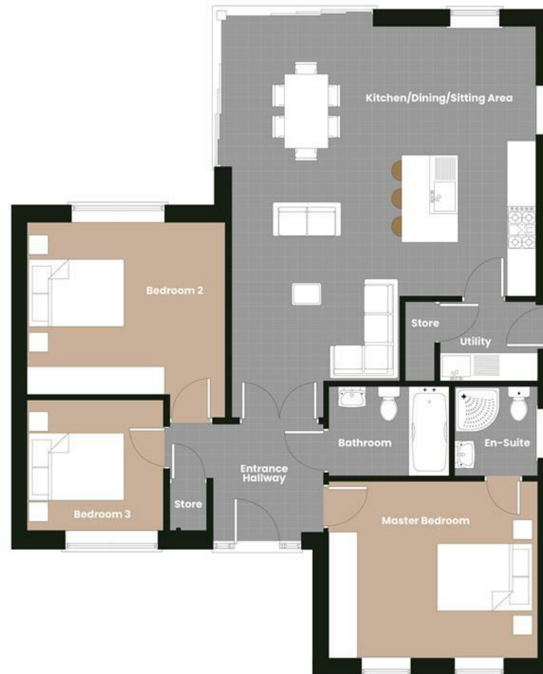
Ground Floor Plan - Plot 4