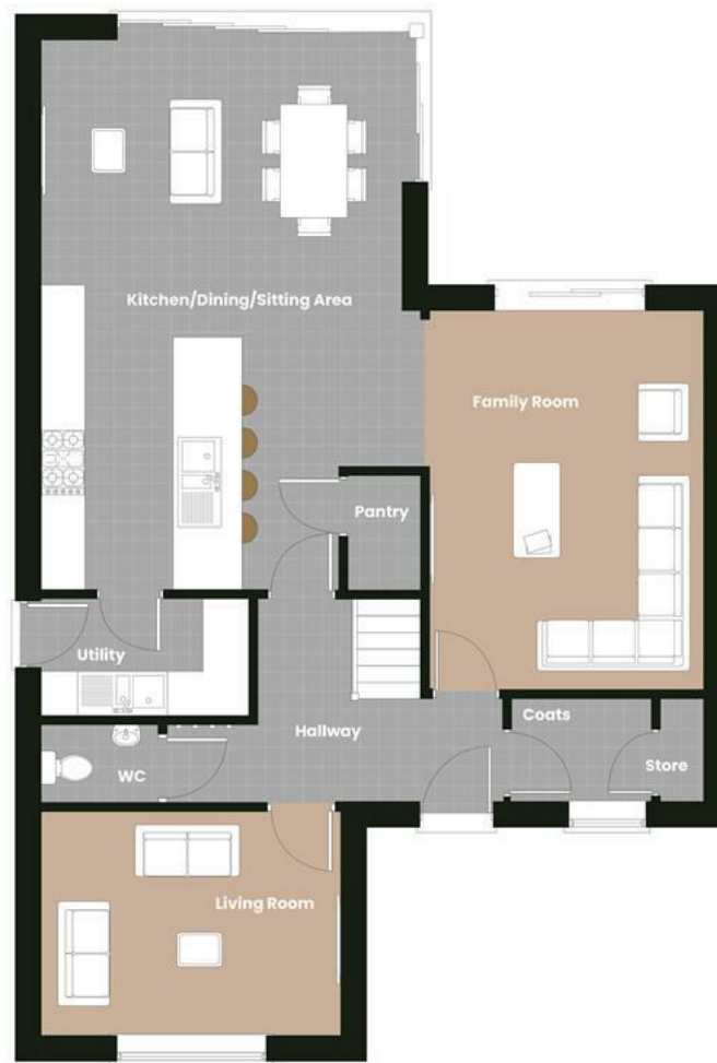
Ground Floor Plan - Plot 1