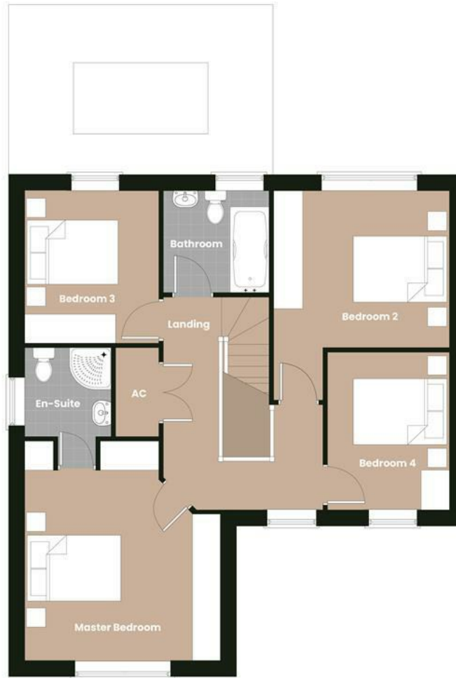
First Floor Plan - Plot 1