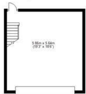
Garage - Ground Floor