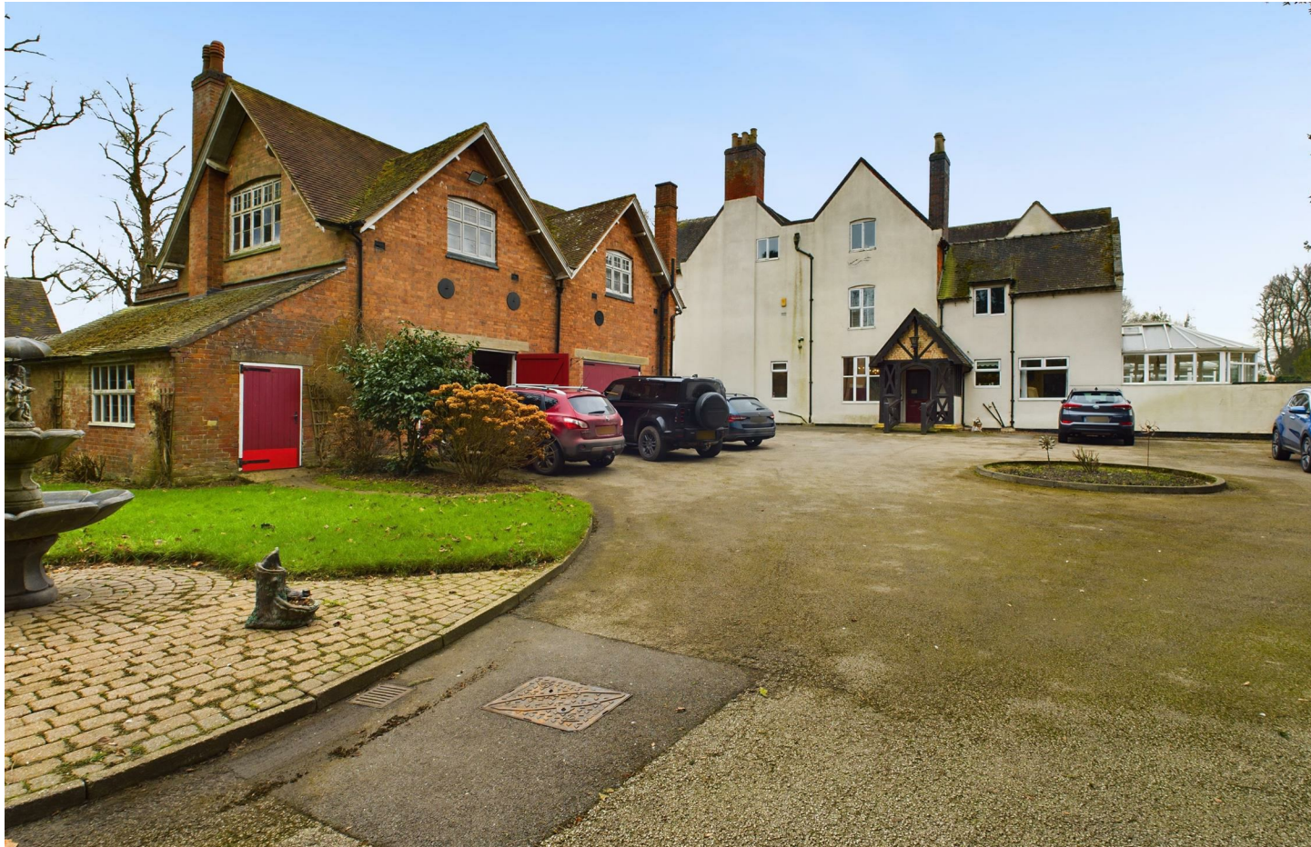
Lullington Hall, Coton Road, Lullington

A rare and prestigious opportunity, Lullington Hall is a historically significant and imposing country residence situated at the heart of the picturesque village of Lullington. This remarkable property exudes period charm, showcasing an abundance of original character features and offering over 6,000 sq. ft. of accommodation within the main house.