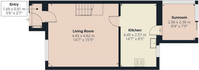
Floor 0 Building 1