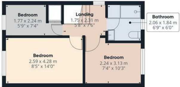
Floor 1 Building 1