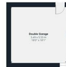
Floor 0 Building 3