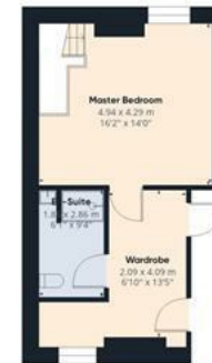
Floor 2 Building 1