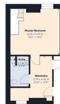
Floor 2 Building 1